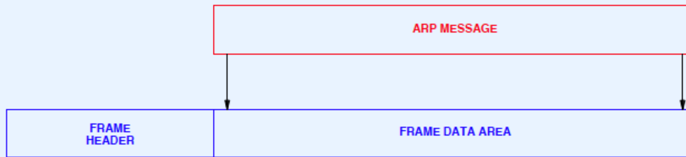
Illustration Of ARP Encapsulation